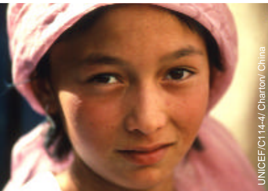
UNICEF/C114-4/ Charton/ China