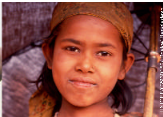
UNICEF/C2930-152/ Dhaka/ Bangladesh